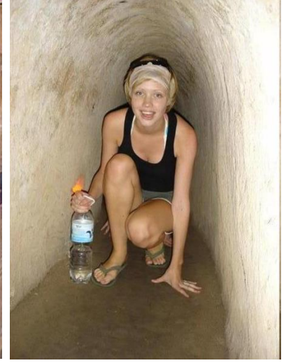
(Left) A major communications tunnel that is well braced. (Right) A smaller tunnel that has been enlarged to allow tourists to crawl through it without suffering panic attacks.