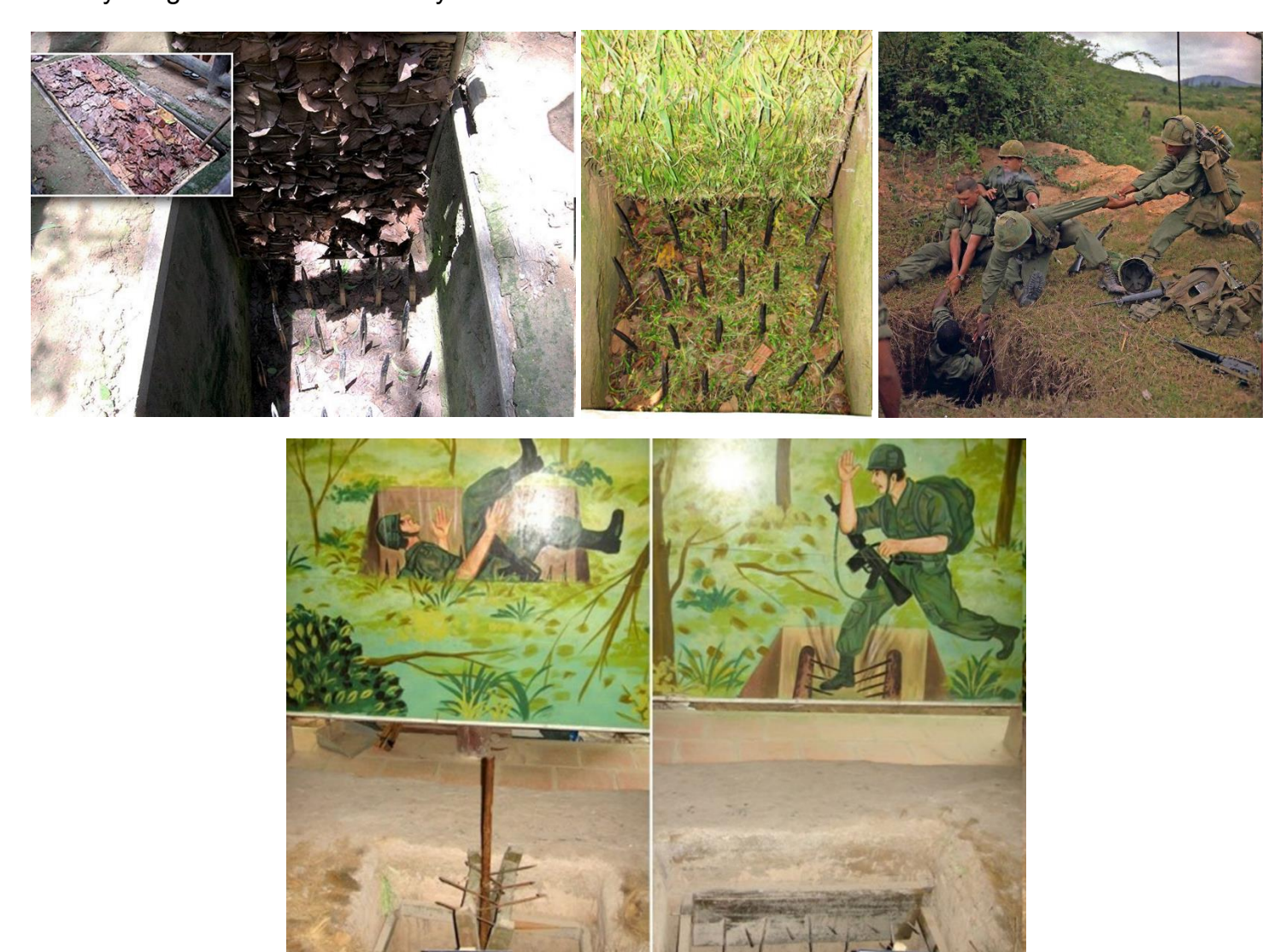
Here you see another type of punji stick trap that featured (right side) two separate axles with punji sticks attached. The soldier would step in the middle and fall so that his legs, side, or arms were punctured with punji sticks. (Left side) Another type of trap was spring loaded and punctured the soldier when he stepped in the middle of it.