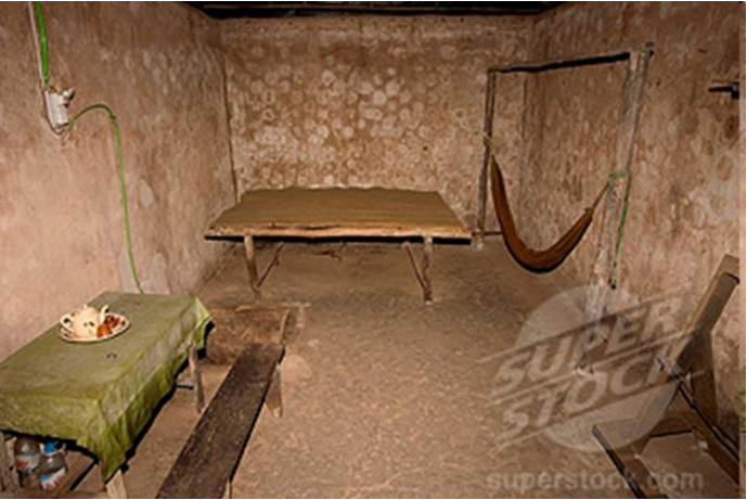
The tunnel systems included large rooms used for planning military strategy, sleeping, hospitals, and for storing large quantities of weapons and food. There was over 200 miles of tunnels. The tunnels were first started by the Vietnamese to fight against the French, who controlled Indochina as a colony until 1954 when America took over.