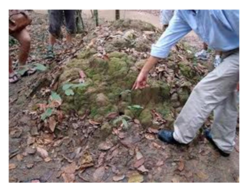
Shown above is a ventilation hole for the tunnels below. Ventilation holes for cooking stoves were usually a significant distance away from the kitchen.