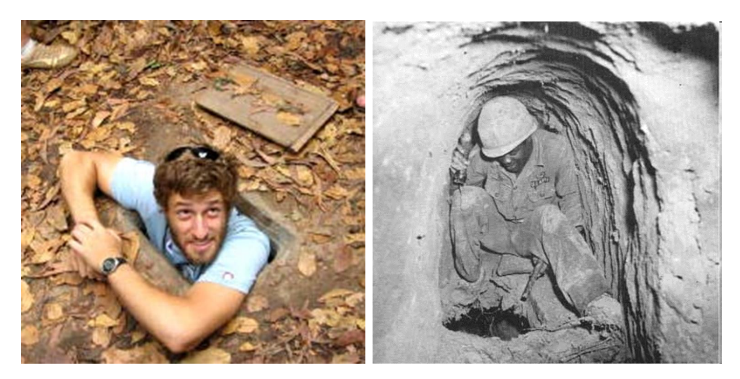
The tunnels of Cu Chi have become a popular tourist destination. Many of the tunnels have been increased in size by four times their original size in order to allow tourists to experience them. It was difficult to breath in most of the tunnel system because there was not enough ventilation holes. The Viet Cong were worried they would give away the locations of the tunnels or cause the tunnels to collapse when American tanks passed overhead.