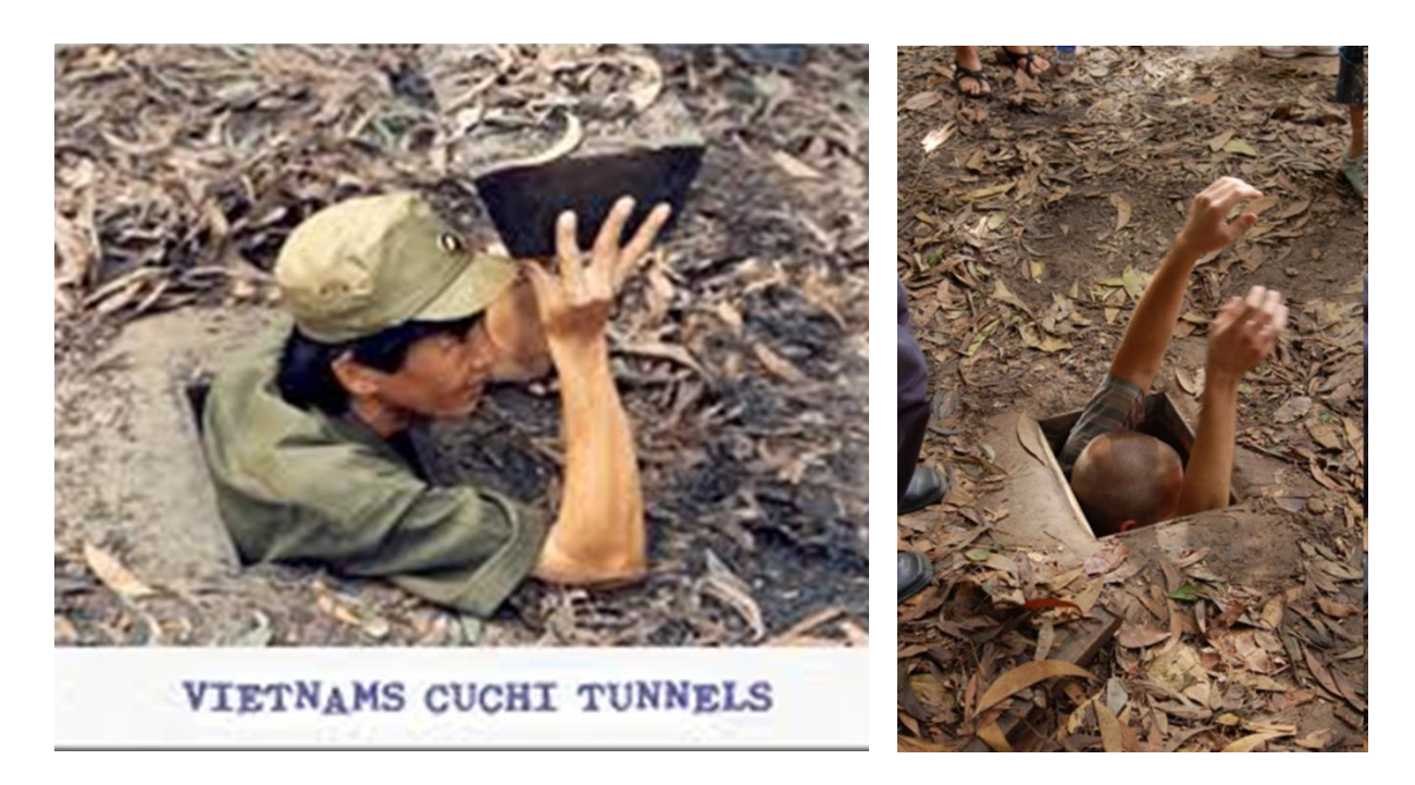
Tunnel entrances were usually very well hidden and they were often booby trapped with explosives. The U.S. military created a special force known as the "Tunnel Rats" to fight in the Viet Cong tunnels. Many of the Tunnel Rats were small Latino soldiers.