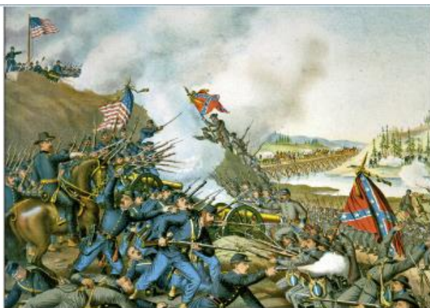
The Southern Cross is flown during the 1864 Battle of Franklin in Tennessee

After the shootings, calls arose once again in South Carolina