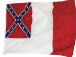
'Blood-Stained Banner' 1865

The second national flag incorporated the Southern Cross into its design. But critics said the white looked too much like a surrender flag.