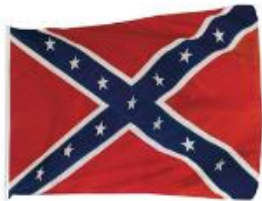
'Southern Cross' 1861-65

Today, seven Southern states incorporate elements of the battle flag design in their state flags. Mississippi uses the entire Southern Cross in a corner of its flag.