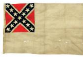
'Stainless Banner' 1863-65

The first official flag of the Confederate states was so similar to the Union flag that it left soldiers on smoke-filled battlefields confused.