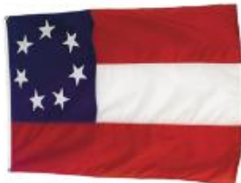
'Stars & Bars' 1861-63

What most people today call the Confederate flag was actually a battle flag flown by Confederate Army units, including General Robert E. Lee's Army of Northern Virginia.