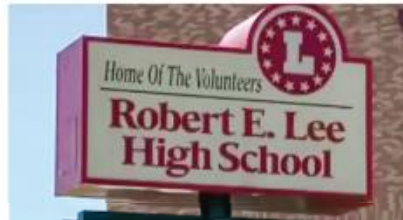
Robert E. Lee High School in San Antonio: Debates are raging at this and other schools named for Confederate icons.

The flag isn't the only Confederate symbol being re-examined. Countless streets and parks named after Confederate figures as well as public monuments honoring them have also recently come under attack. In July, Memphis, Tennessee, voted to remove a park statue of Nathan Bedford Forrest, a Confederate commander and the first leader of the Ku Klux Klan.